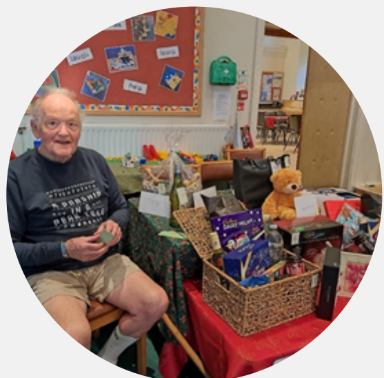
Raffle prizes are generously donated every year by local businesses and members of the congregation.